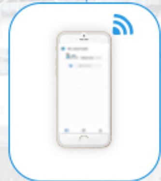
APP WIFI Control