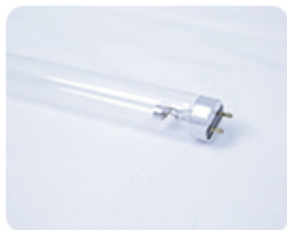
253.7nm UV-C Lamp